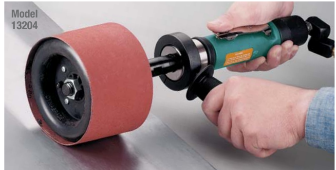
13204 Dynastraight® powers optional 94472 Dynacushion® pneumatic wheel on stainless steel.