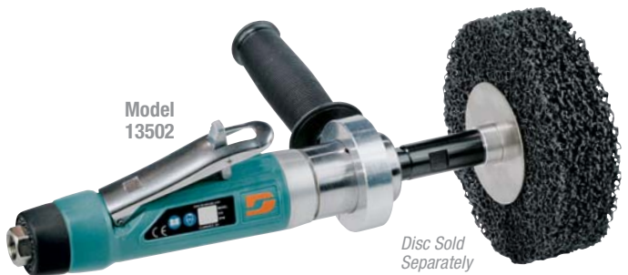
Disc Sold Separately

See page 248 for detailed arbor information.