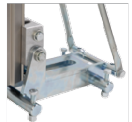
Drilling in very restricted space using steel dowel feet DRA250***