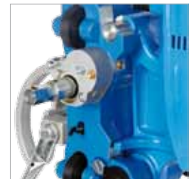
Fatigue free, ergonomic operation using fine feed operation ( i=1:3,5 )