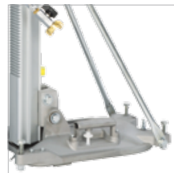
DRU250*** with aluminium dowel-vacuum foot