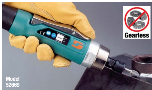
Use a carbide burr to easily blend weld seams.